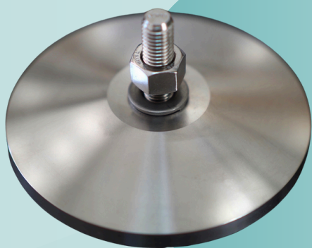
Diameter : 120 mm