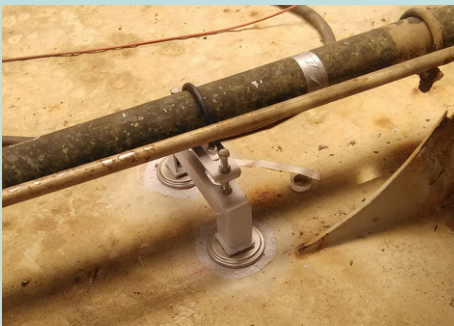
Large pipe supports