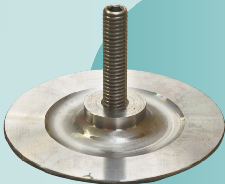
Diameter : 70 mm

C-CLAW S300 is the ultimate equipment for marine and offshore environments, and other highly regulated industries. This versatile fastener can be used for any maintenance work during your operations , as well as for new designs.